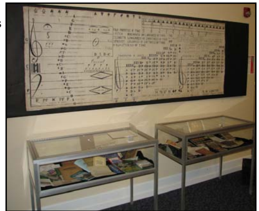
The key item on display in the exhibit of CPM materials was the large (3’ x 8’), hand-drawn pedagogical chart created in 1937 by R. W. Ledbetter of Livingston, Tennessee.

It is hoped that the momentum generated by the “Farther Along” conference will result in additional scholarly attention being given to this important genre of southern music. More importantly, it is hoped that the conference will stimulate interest from within the convention singing world in maintaining the health of the tradition.