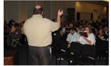
A public singing was held on Friday night, April 4. Different people came to the front of the room to lead the singing.