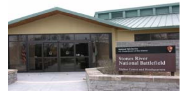
With annual visitation at the Battlefield on the order of 200,000 people, the exhibits have been a wonderful means of sharing the Center's archival resources with members of the general public.